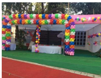
Bihar - Ek Virasat - Journey of CFSI

Children's Film Society India in collaboration with Asian Center for Entertainment Education-the Third Eye (ACEE) had organized Children's Film Festival in Patna and tied up with the Kasturba Gandhi Balika Vidyalaya (KGBV) at Durgawati and Kilkari Bihar Bal Bhavan to co-organize a film festival from 17th March to 20th March, 2016.