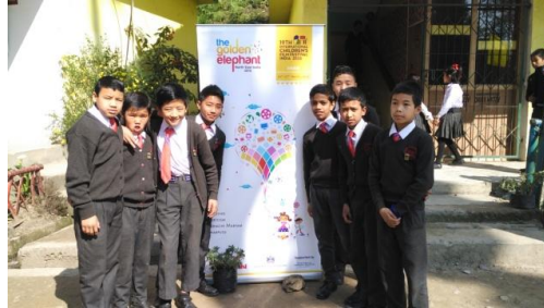
ICFFI - Sikkim

After successful completion of 19th ICFFI in Hyderabad from 14th to 20th November, 2015 CFSI conducted a similar International Children’s Film Festival in north east in collaboration with Cultural Affairs & Heritage Department, Sikkim at 6 places Dodak, Angden, Daramdin village, Rinchenpong, Sombaria and Kaluk of West Sikkim with the opening ceremony in Gangtok from 14.03.2016 to 16.03.2016.